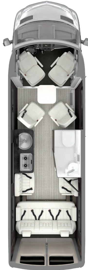
Interstate 24GL 4x2

In the Interstate 24GL, the fun doesn't have to wait to begin until you arrive at your destination, the fun begins the moment you step inside.