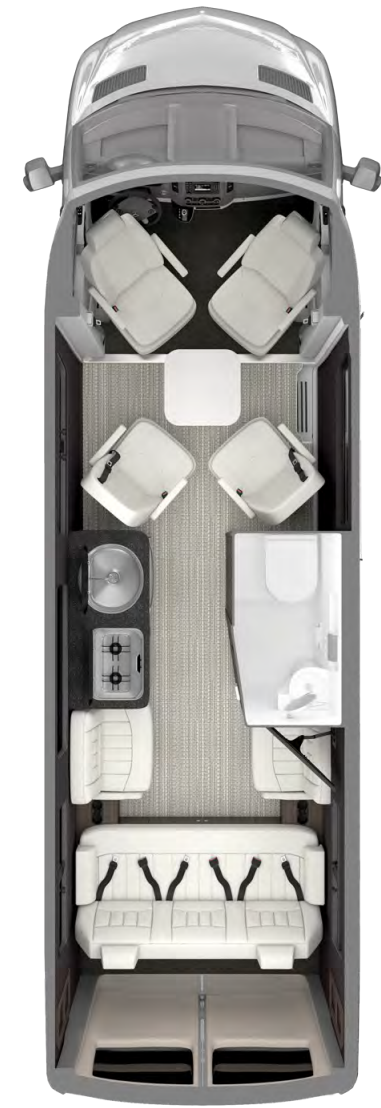
Interstate 24GL 4x4